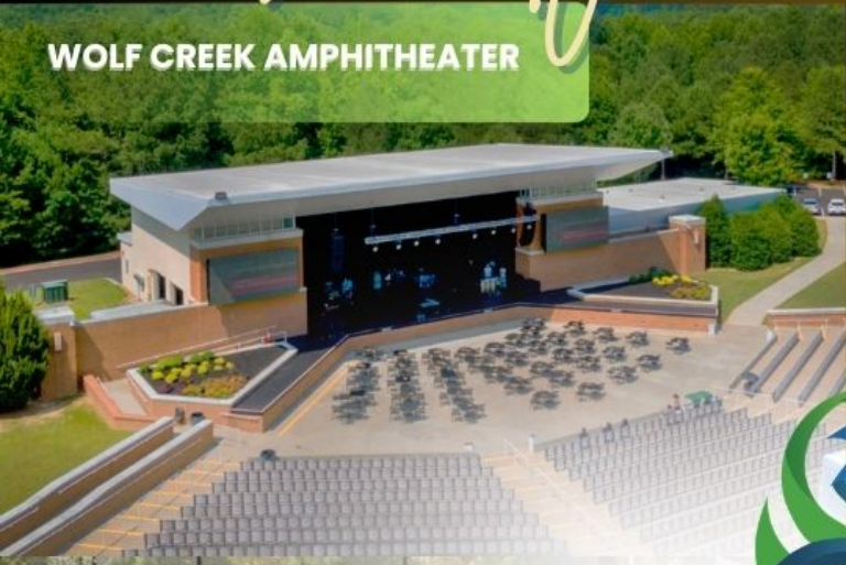
WOLF CREEK AMPHITHEATER