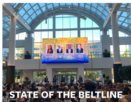
STATE OF THE BELTLINE