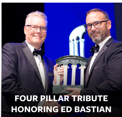
FOUR PILLAR TRIBUTE HONORING ED BASTIAN