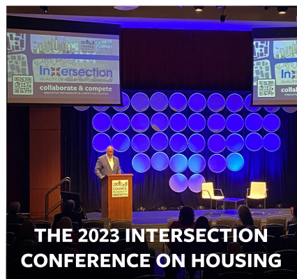
THE 2023 INTERSECTION CONFERENCE ON HOUSING