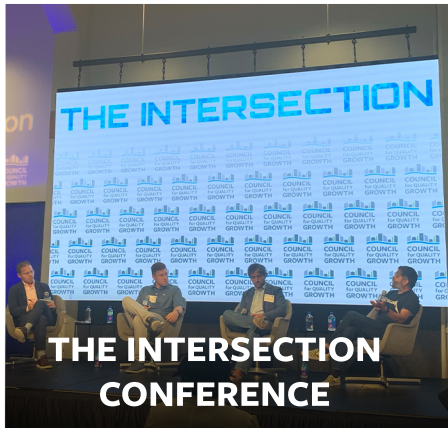
THE INTERSECTION CONFERENCE