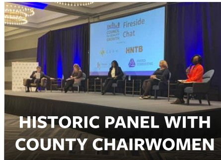
HISTORIC PANEL WITH COUNTY CHAIRWOMEN