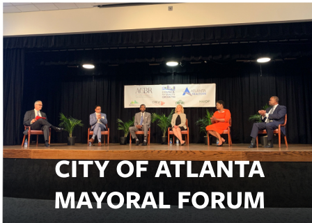
CITY OF ATLANTA MAYORAL FORUM