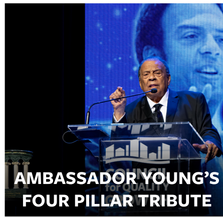
AMBASSADOR YOUNG'S FOUR PILLAR TRIBUTE